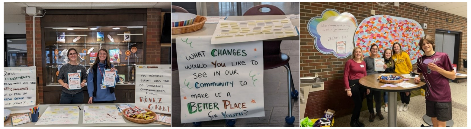
Youth engagement at École secondaire catholique Sainte-Marie, Kirkland Lake District Composite School, and Timiskaming District Secondary School

The Local Action Teams will use the results from these engagement sessions to inform action plans.