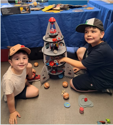
Science North Stellar Science, Summer 2023