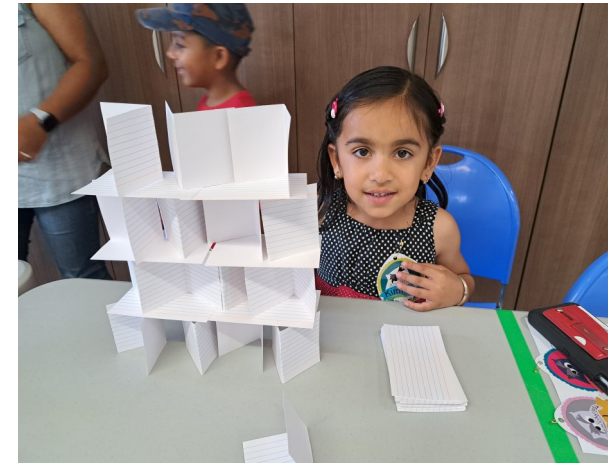
STEM engineering program during the Summer Reading Program, 2023