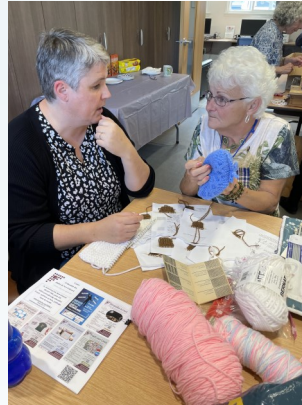
ACFO Culture Days, Fall 2023

The Temiskaming Shores Public Library is a source for inspiration and inclusion in our community. We enhance our neighbourhoods by providing access to resources, programming, and opportunities for participatory learning and leisure in both official languages.